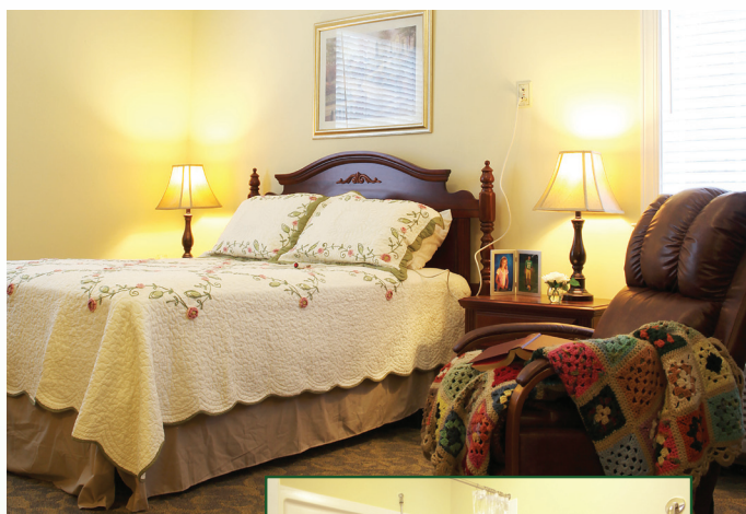
Forest Wood private suite and bath with walk-in shower

A monthly Respite Care stay is perfect when your support system is out of town or ill. It is also an easy way to visit and experience the Magnolia Gardens lifestyle before making a permanent move decision.